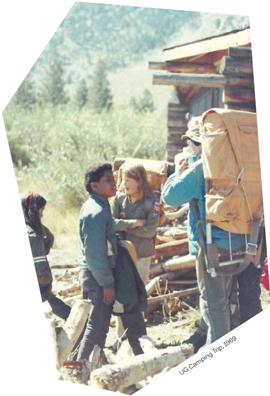
UG Camping Trip, 1969